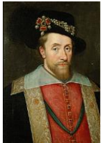
King James I of England